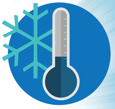
3. Temperature that is inconsistent with thermostat setting