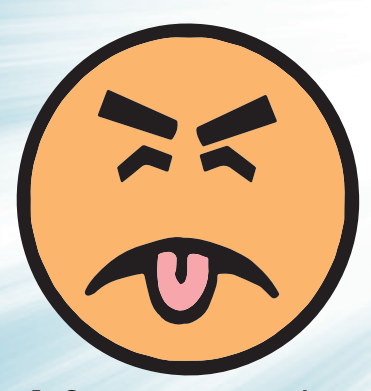
4. Strange or musty odors