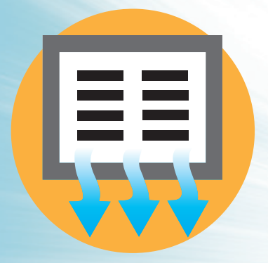
1. Vents blowing cold air in heat mode